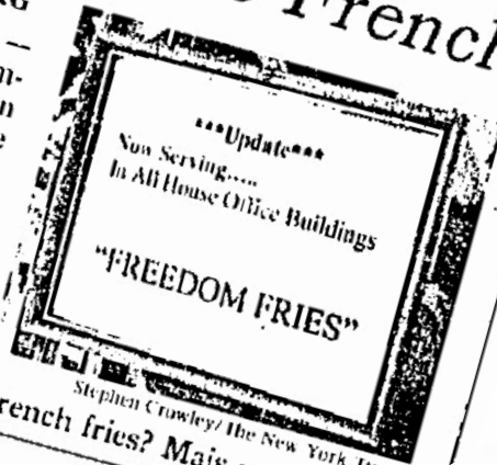
French fries? Mais non!

WASHINGTON, March 11 — The French may have Champagne, Brie, croissants and even kisses. Americans, at least in the cafeterias of the House of Representatives, now have freedom fries and freedom toast. With frustration rising in the Capitol over French opposition to President Bush's policy on Iraq, Representative Bob Ney, the Ohio Republican who is chairman of the House Administration Committee, which is responsible for